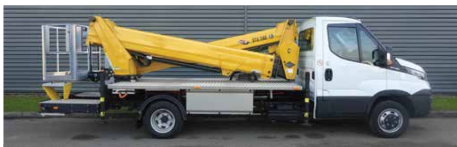
Low travel height