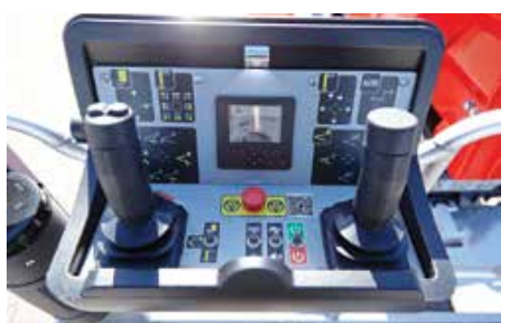
Easy to use full proportional (FPC) CANbus controls with display