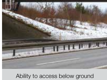
Ability to access below ground