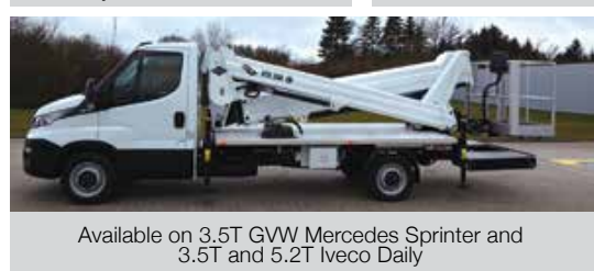
Available on 3.5T GVW Mercedes Sprinter and 3.5T and 5.2T Iveco Daily